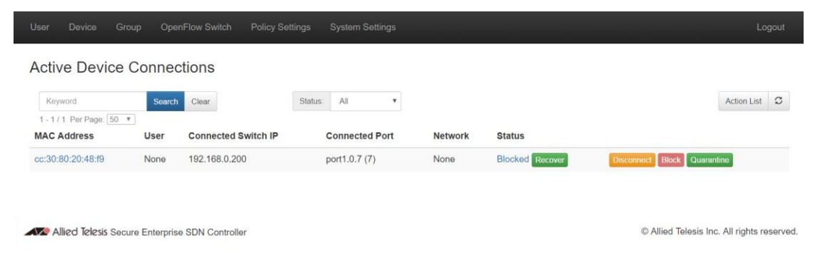
Figure 2: Infected host is blocked from the network.

The network / security operator is notified by an alert from Flowmon ADS and can analyse attack details to get more information about the attacker and its victims. From event details in Flowmon ADS, the operator immediately sees detailed information about the attack and also each individual flows on which the event was detected.